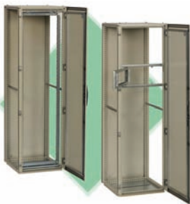
NEW Flange Mount Disconnect Series

NEW range of partial and full height Swing Frames